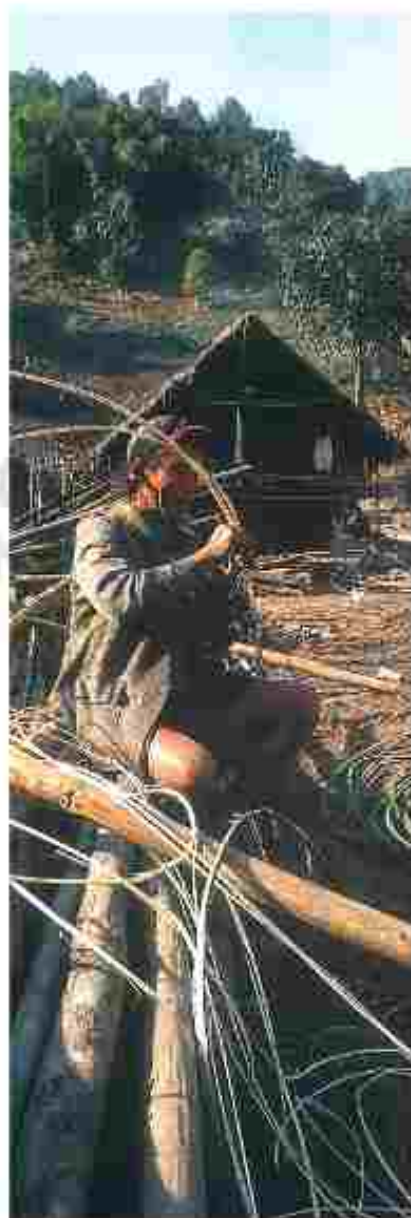
Fig. 5 – A log house being built in a village of the Nylshi tribes of Arunachal Pradesh.

Bewar – A term used in Madhya Pradesh for shifting cultivation