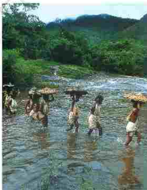
Fig. 1 – Women of the Dongria Kondha tribe in Orissa wade through the river on the way to the market

You have read about tribal societies last year. Most tribes had customs and rituals that were very different from those laid down by Brahmans. These societies also did not have the sharp social divisions that were characteristic of caste societies. All those who belonged to the same tribe thought of themselves as sharing common ties of kinship. However, this did not mean that there were no social and economic differences within tribes.