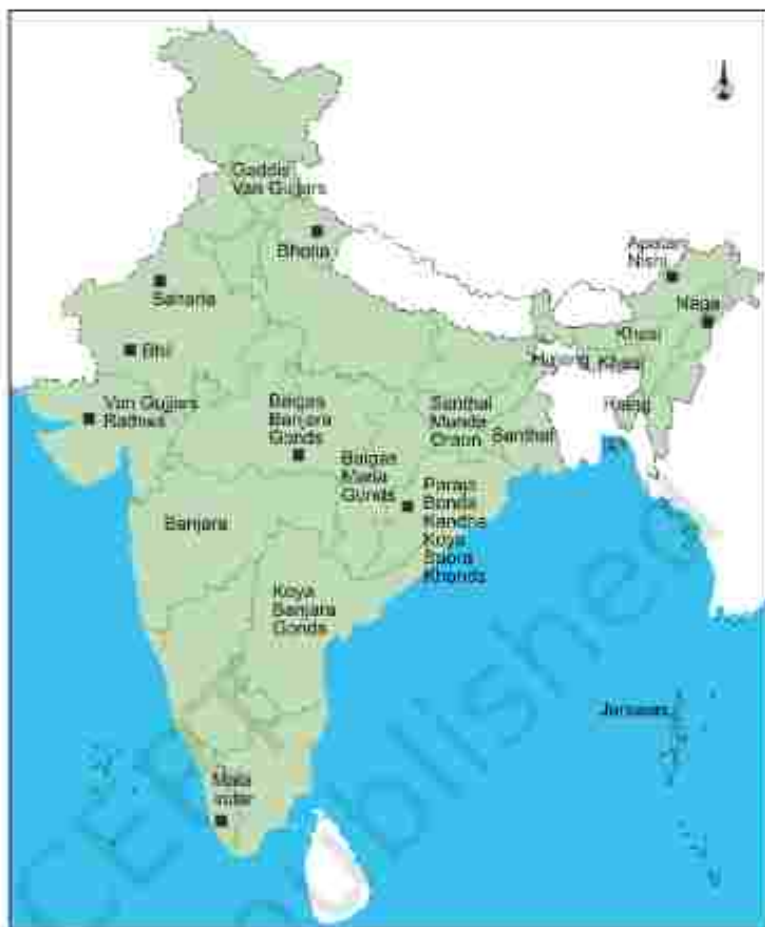
Fig. 3 – Location of some tribal groups in India:

Many tribal groups lived by herding and rearing animals. They were pastoralists who moved with their herds of cattle or sheep according to the seasons. When the grass in one place was exhausted, they moved to another area. The Van Gujjars of the Punjab hills and the Labadis of Andhra Pradesh were cattle herders, the Gaddis of Kulu were shepherds, and the Bakarwals of Kashmir reared goats. You will read more about them in your history book next year.