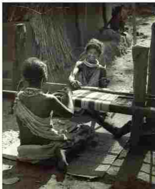
Fig. 8 – Godara women weaving

Many tribal groups reacted against the colonial forest laws. They disobeyed the new rules, continued with practices that were declared illegal, and at times rose in open rebellion. Such was the revolt of Songram Sangma in 1906 in Assam, and the forest satyagraha of the 1930s in the Central Provinces.