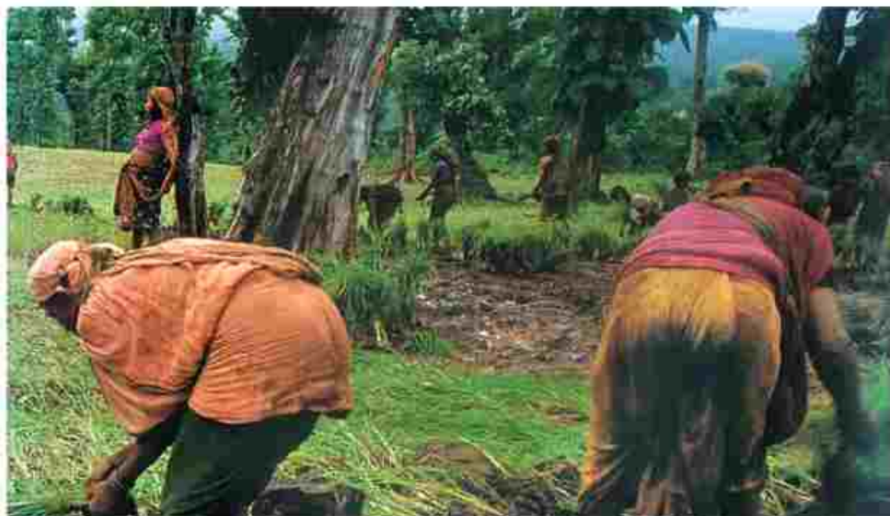
Fig. 6 – Bhil women cultivating in a forest in Gujarat

Shifting cultivation continues in many forest areas of Gujarat. You can see that trees have been cut and land cleared to create patches for cultivation.