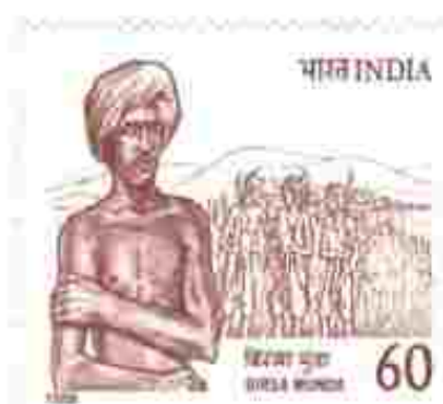
Postal stamp (issued in memory of Birsa Munda)

In 1900, Birsa died of cholera and the movement faded out. However, the movement was significant in at least two ways. First – it forced the colonial government to introduce laws so that the land of the tribals could not be easily taken over by dikus . Second – it showed once again that the tribal people had the capacity to protest against injustice and express their anger against colonial rule. They did this in their own specific way, inventing their own rituals and symbols of struggle.