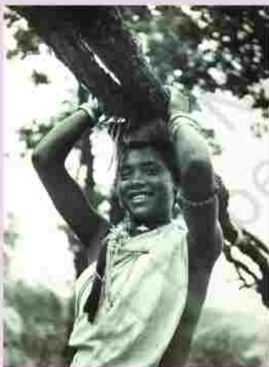
Fig. 4 – A Santhal girl carrying firewood, Bihar, 1946

In Chait women went to clearings to... cut stalks that were already reaped; men cut large trees and go for their ritual hunt. The hunt began at full moon from the east. Traps of bamboo were used for hunting. The women gathered fruits like sago, tamarind and mushroom. Baiga women can only gather roots or landa and mahua seeds. Of all the adivasis in Central India, the Baigas were known as the best hunters... In Baisakh the firing of the forest took place, the women gathered unburnt wood to burn. Men continued to hunt, but nearer their villages. In Jeth sowing took place and hunting still went on. From Asadh to Bhadon the men worked in the fields. In Kuar the first fruits of beans were ripened and in Kartik kuchi became ripe. In Aghen every crop was ready and in Pur winnowing took place. Pur was also the time for dances and marriages. In Magh shifts were made to new bewars and hunting-gathering was the main subsistence activity.