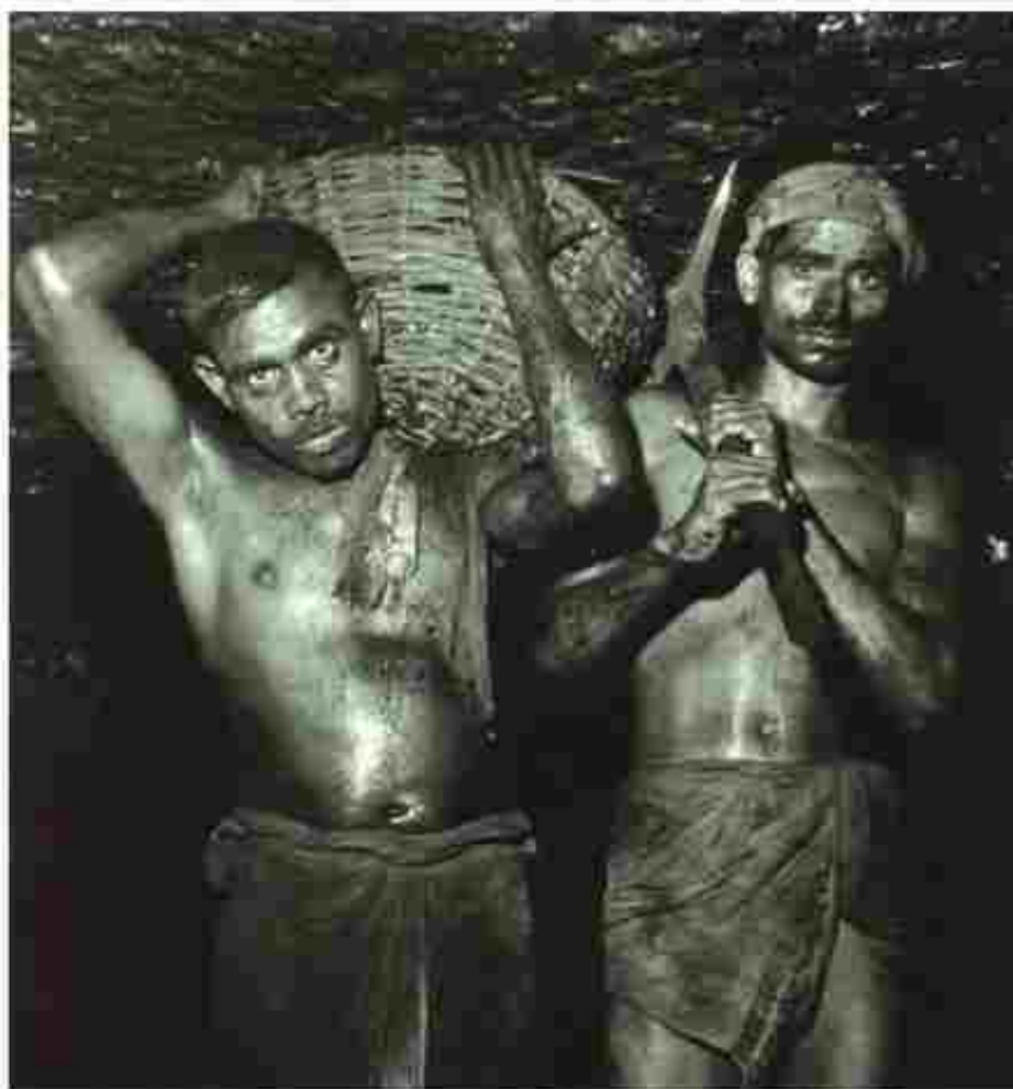
Fig. 10 – Coal miners of Bihar, 1948

In the 1920s, about 50 per cent of the miners in the Jharia and Raniganj coal mines of Bihar were tribals. Work deep down in the dark and suffocating mines was not only back-breaking and dangerous, it was often literally killing. In the 1920s, over 2,000 workers died every year in the coal mines in India.