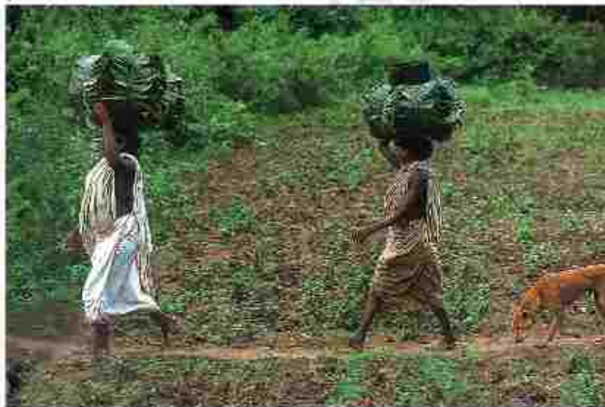
Fig. 2 – Dongria Kandha women in Orissa take home pandanus leaves from the forest to make plates

Mahua – A flower that is eaten or used to make alcohol